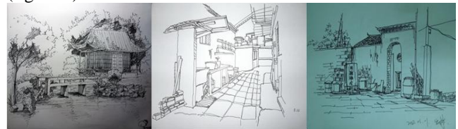
Figure 2. The student works

Students through the art of study, through the line drawing, color and fine art appreciation of a series of course, contact construction drawing and construction of all kinds of painting, such as watercolor, liquid powder, mark pen, color pencil, etc., and through the art practice opportunities, make sketchy ability get exercise and improve. In the Practice week, ruled out other courses and other external factors of interference and concentrate on improving the aesthetic cognitive ability and free expression ability. (figure 2)