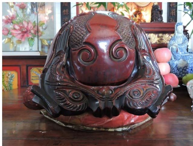
Figure 5. Wooden Fish (Mu Yi), in the main altar of Vihara Buddhi, Bandung.