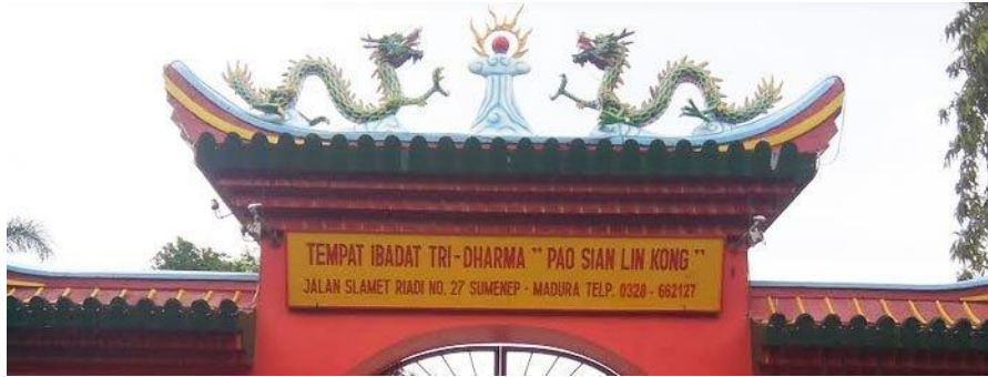
Figure 2. Main gate of Tempat Ibadah Tri Dharma in Madura, East Java.