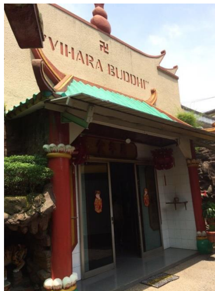
Figure 3. Main Gate of Vihara Buddhi, Bandung, West Java.