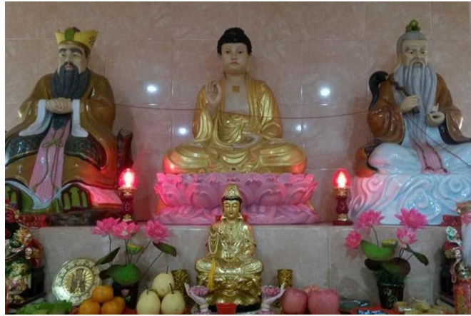
Figure 1. Display of San Jiao altar, left to right: statue of Kong Hu Chu, Buddha, Lao Zi.

The influence of San Jiao teachings in China slowly diminishes along with the introduction of Communism, which later takes off to become China's main ideology. Nevertheless, it is practiced in other countries where Chinese descendants live, such as Taiwan, Hong Kong, Macau, Singapore, and Indonesia. Currently in Indonesia, San Jiao teaching is officially known as Three Teachings and Kelenteng (temple) is recognized as a religious site called Tempat Ibadah Tri Dharma (TTID) / Three Teachings place of worship (Tanggok, 2017: 27). Both policies are legitimized by the Indonesian Minister of Religious Affairs on 19 November 1979. " Kelenteng " is an Indonesian name for a place of worship used by Chinese descendants in Indonesia. According to Sugiri Kustedja (2017: 3), the word " Kelenteng " is only used in Indonesian language and is not found in the Chinese vocabulary. Some linguists argue that the word comes from the " teng-teng " sound from inside the building whenever a ceremony is held. It is the sound of bells during reading of Buddhist paritta or ceremonies' main event (Kwa Tong Hay, 2013: 2). Alternatively, some people use the term " pekong ". A Kelenteng is usually built by people who have the same family name and live in the same area (Tanggok, 2017: 27).