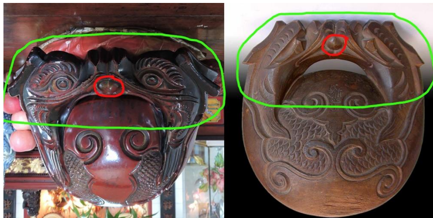
Figure 9. Left: Mu Yi at Vihara Buddhi. Right: mokugyo . Green marks: Dragon-like fish heads, biting a pearl (red mark). (Tjutju Widjaja)

Wooden fish at Vihara Buddhi is a type of a later development of the original wooden fish. The shape is designed to adjust its function as a specific sound or musical instrument. The style of carving on this instrument is not yet known, there are some design similarities in carvings between mu yi (Chinese wooden fish) and mokugyo (Japanese wooden fish): Both have dragon-like fish heads, and this part is also has a function as handle. The author assumes that the shape of a dragon-like fish head is a result of strong influence from Chinese culture, dragons are mystical animals that are highly adored in China. This assumption is corroborated by the fact that the legend of wooden fish is originated from China.