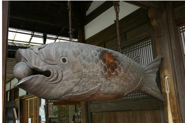
Figure 8. Original version of wooden fish.

Wooden fish at Vihara Buddhi is a type of a later development of the original wooden fish. The shape is designed to adjust its function as a specific sound or musical instrument. The style of carving on this instrument is not yet known, there are some design similarities in carvings between mu yi (Chinese wooden fish) and mokugyo (Japanese wooden fish): Both have dragon-like fish heads, and this part is also has a function as handle. The author assumes that the shape of a dragon-like fish head is a result of strong influence from Chinese culture, dragons are mystical animals that are highly adored in China. This assumption is corroborated by the fact that the legend of wooden fish is originated from China.