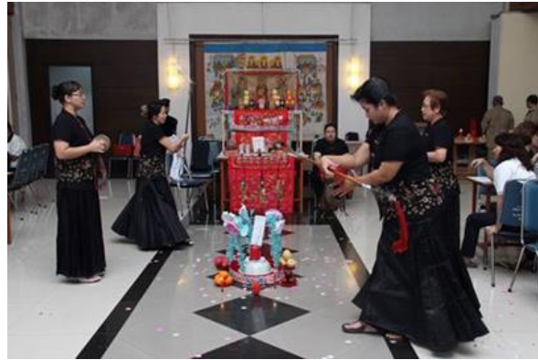
Figure 4. A group of Zhai Ji performing death ritual. (Tjutju Widjaja)

These Zhai Ji women were born in the late 19th century, when China was collapsing due to problems of drug addiction, Western countries' aggression, overwhelming corruptions, and failing economy. These problems have caused people to suffer, especially women. Among the poorest are the women of Hakka; they are unappreciated and have to work hard to provide for their families. Above all, they are also victims of domestic abuse. This condition has touched a xianghua monk to educate those marginalized women, be them widows, housewives, or children whom are abandoned.