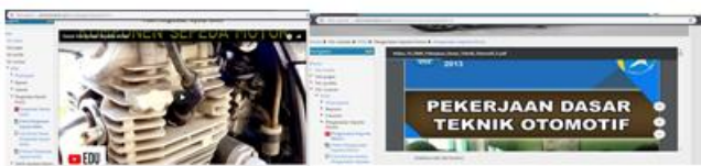
Figure 1. Display of technology homepage Live Personal Streaming 24 Hours

In Figure 1. and Figure 2., shows that the Live Personal Streaming 24 Hours technology has content in the form of the main menu, consisting of: Profile, curriculum, E-learning, E-Library, Live Streaming, Quiz Online, and Chat & Ask. Also, the live streaming facility is a student media for conducting 24 hour online learning/clinics to lecturers. Furthermore, the results of