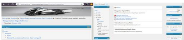
Figure 1. Display of technology homepage Live Personal Streaming 24 Hours

The results of the study describe the research that includes the percentage of student answers on each topic of the material, a description of the factors that cause the low competency and mindset of students in the motorcycle technology course, and the results of the effectiveness of learning tests with Live Personal Streaming 24 Hours technology. As an alternative, the problem is the low competency and mindset of students. Live Technology Personal Streaming 24 Hours developed has a website address, namely otomotortech.com. Screenshot of the online technology is shown in Figure 1 and Figure 2.