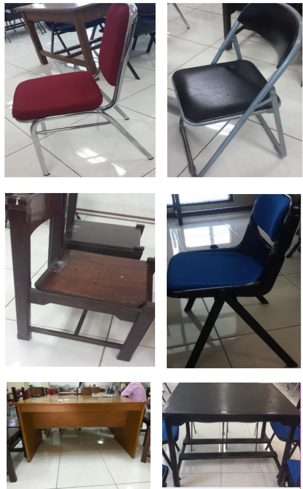
Fig. 1. Types of chairs and desks analyzed.