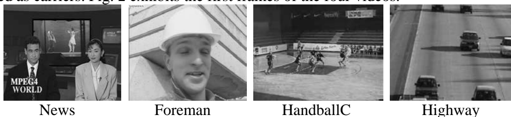
Fig. 2. The first frames of the four video sequences

For the sake of evaluating the performance of our proposed method, four public video sequences are utilized as carriers. Fig. 2 exhibits the first frames of the four videos.