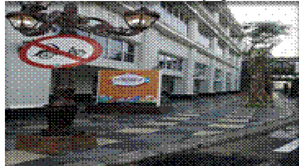
Figure 2. Feasible Pedestrian At "Tunjungan" Road

difficulty in climbing down the sidewalk or pedestrian. Conditions can be observed from the figure 2 pedestrian at the 'Tunjungan's' road.