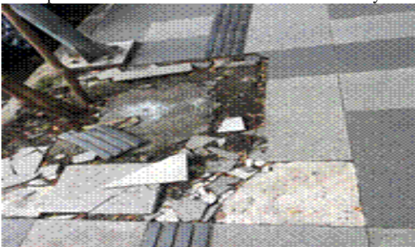
The pedestrian lane not in accordance with safety criteria.