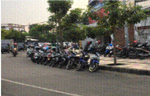
Figure 3. Un-Used Function Of Pedestrian

rights. Persons with disabilities find it difficult and do not find comfort in accessing the pedestrian facilities provided (111) . The condition of redirects function of the pedestrian to other activities that are not in accordance with its use as shown in figure 3: