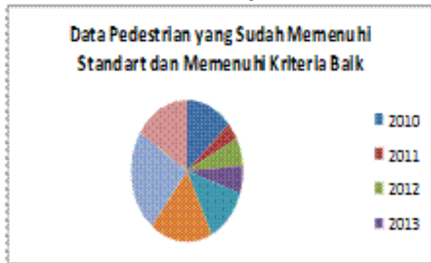
Pedestrian Data Chart With Right Standard And Criteria

Source: Department of Public Works of Bina Marga and Pematusan Kota Surabaya