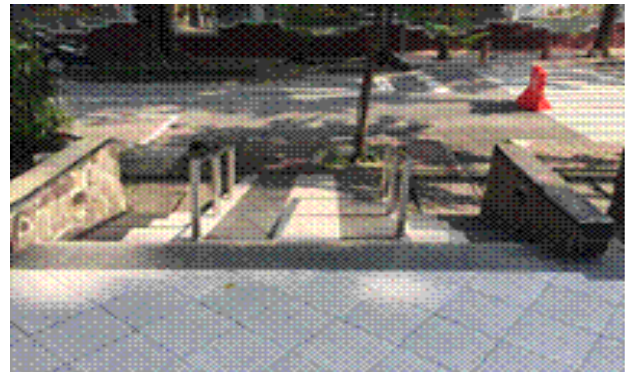
Figure 4. Ramps And Ground Floors To Support The Safety Of Persons With Disabilities

ladder as well as guiding routes and guiding tiles on the blind person to assist in walking on the pedestrian.