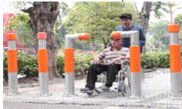
Figure 5. Roadblocks to secure and comfort persons with disabilities.

To complete the technical requirements, the Surabaya municipal government has built a barrier to anticipate rider passing pedestrians for persons with disabilities. Provision of roadblocks in every corner in the city of Surabaya one of them as in the Mayjend Sungkono’s Road.