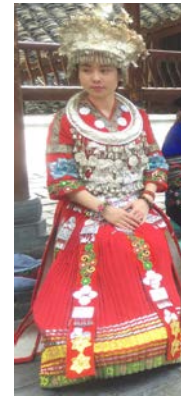
Fig. 6. Miao festival costumes.

Guizhou are dressed in red, orange and sky blue embroidery. Red is widely used in thematic pattern, and is set off by black base cloth. Therefore the whole picture is very clear and harmonious, three-dimensional, extremely strong sense of hierarchy. Miao decorative patterns can be extracted. All these patterns used in bags, clothing, scarves are very beautiful. They appear not only fashion, but also full of national characteristics. When Miao decorative patterns applied to the design of modern clothing, the shape and color appear new and unique. Miao girl's festival dress is elegant, colorful, with silver headdress and collars, filled with festive atmosphere as shown in the Miao ethnic festival. The clothing of the Miao is closely associated with nature, and it shows the beauty of nature. It expresses the idea of man and nature merge into one. The Miao people have the reputation of "clothing clan". Their clothing was described as "living fossil of Chinese clothing history". Miao nationality dress pattern is numerous, color is gorgeous, the pattern is rich, the design is varied, together with the craft is exquisite unique, the silver ornament of glittering and shining is beautiful. The modern clothing that use Miao nationality's adornment art design, modeling is unique, color collocation is ingenious. Figure 7 is the clothing that blends into the Miao elements. Figure.8 is a reference to the decorative arts of the Miao nationality. The colors are bright and rich.