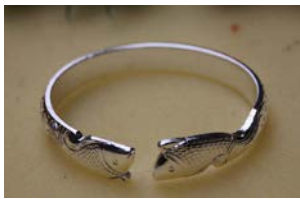
Fig. 14. Double fish bracelet.