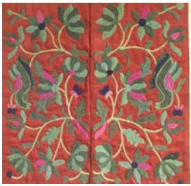
Fig. 1. Braided embroidered flower.