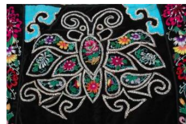
Fig. 3. The butterfly totem.

[3] Cattle are loyal partners of Miao ancestors and the animals that depend on them. The Miao people regard cow horn as totem to show the cow worship, and cow horn becomes a typical Miao decorative art symbol. The most typical example of Miao women wearing ox horn silver crowns on their heads is also the physical manifestation of ancestor worship. The silver horn of the Leishan Miao girl is an ornament worn only for grand festival activities and marriage. See Figure 5 silver horns headdress and silver collar. Silver horn along with the girl's graceful figure fluttering in the wind, magnificent dignified add a few light and lively. Wearing holiday costumes and wearing silver headgear, girls are dancing to the drum music is the most beautiful scenery in Miao culture and art.