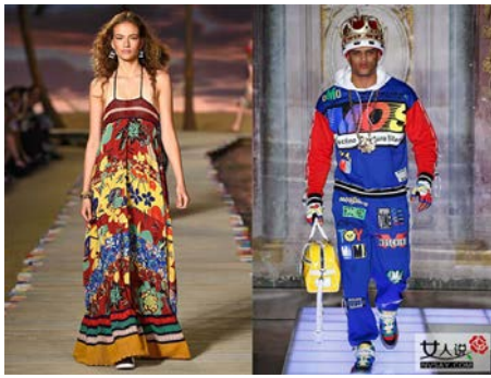
Fig. 8. Costume of Miao decorative art.

On the whole, modern clothes shown in Fig. 7 and 8 produced by a variety of techniques used in combination with a variety of Miao decorative art symbols. The colors are matched with freedom and the composition is distinctive. As a result, these garments are dazzlingly, colorful and vivid national art features, reflecting the perfect blend of modern and national clothing design.