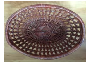
Fig. 11. Fern platter.

Most of the product designs of Miao choose natural materials, such as wood, cotton, bamboo and other natural materials. Traditional and environmentally friendly processing methods usually applied. Hard-working and wise Miao people use bracken to make artifacts. It is a typical green design. The fern braid is mainly made from the fern stem, and this raw material gives the fern braid a different characteristic. Because the fern stem contains bitter element and cellulose so the fern braid is not easy to be mildew, not easy to change color, variation, thus the fern braid has a unique style. As shown in figure 11, the fruit plate is made with ferns. Figure 12 is a pendant lamp with a fern pole. These products are novel, practical and full of national characteristics. In addition, the traditional handicraft will be inherited.