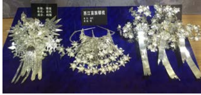
Fig. 13. Silver finches and combs of Miao.

social development does not mean that we can abandon the traditional national culture. On the surface, witchcraft, mythology and totem culture may be incompatible with modern society. However, modern designers can find the relevance of traditional culture and modern social culture. Instead of the traditional shape of Miao people's jewelry big, heavy, and complex, we design small, light, simple jewelry. For example, the use of elements designed by Miao elements Pisces bracelets and bull head pendants shown in Figure 14, Figure 15, modeling simple, stylish and sophisticated. They are full of fun.