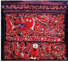
Fig. 4. Miao dragon grain symbol.