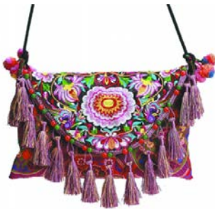
Fig. 9. Miao embroidery satchel.

As shown in Figure 9, the bag is designed by Suzhou Art College students according to the decorative features of Miao Embroidery. The bag is embroidered with vibrant butterflies, flowers, colorful. It has tassels with unique style. Drawing on the embroidery process of Miao embroidery and the textile printed fabric with pattern designed; the textile prints are simple, orderly, and elegant in color, suitable for the sofa of the bedroom. Figure 10 Miao embroidered sofa towel. It is an effective way to preserve and inherit the Miao culture through preserving the unique value of Miao handicrafts, carrying forward the spirit of artisans, re-creating Miao decorative art symbols and making them fashionable and aesthetic in modern products.