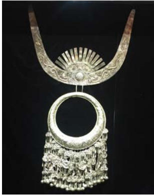
Fig. 5. Silver ox horn head and collar.

The several Miao decorative art symbols mentioned above have been developed from original religious symbols to artistic decorative symbols. Therefore, these artistic symbols have dual function, which is not only the totem of ancestor worship, but also the artistic symbol of aesthetic function.