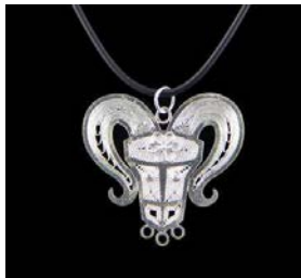
Fig. 15. Bullhead pendant.