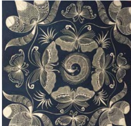
Fig. 2. Batik clothe (butterfly).