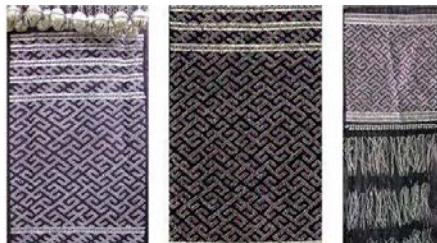
Fig. 10. Sofa scarves.