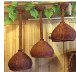
Fig. 12. Fern chandelier.