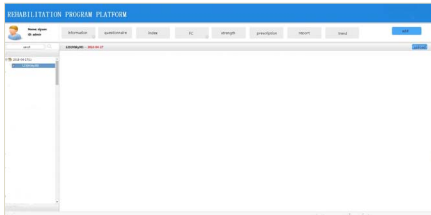
FIGURE III. REHABILITATION PROGRAM PLATFORM