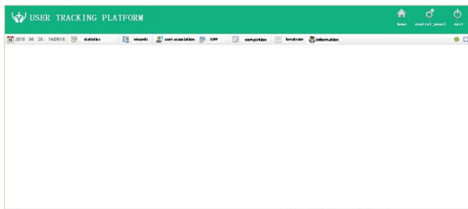
FIGURE IV. USER TRACKING PLATFORM

Cloud service layer provides relevant data processing and technical support for cloud platform, such as the processing of equipment data, providing related computing services, and load balancing. In addition, the cloud service layer also provides virtualization services to hardware and software such as hosts, databases, and networks. RESTful architecture is favored by more and more developers because of its extensibility and simplicity, among which HTTP is a typical application of this architectural style[13]. The system uses meta-operations of data: GET is used to obtain resources, POST is used to create new resources, PUT is used to update resources, DELETE is used to delete resources. What's more, the system uses the standard Bluetooth protocol to implement communication between the mobile terminal and the Bluetooth device. The physical examination device and the system use json communication interface to realize bidirectional transmission of user information and detection information.