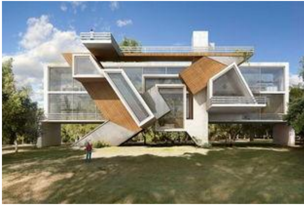
Fig. 4. Surreal Building of Dionisio Gonzalez.

photography, apparel design and building design "Fig. 4". Designers pursue imaginary pictures with increasingly bold technique and peculiar creativity. The development of science and technology increases the paths and possibilities of surreal design. For example, spray gun and mist sprayer are applied to create high quality pictures with surrealist styles, referring to the positive side. The negative side is also prevailing. Surrealist artists get trapped in passive fantasy when pursuing imagination, so that some works become products of fantasy without emotional participation. Subsequent artists deliberately create some weird and resounding techniques of artistic creation and bring vulgar factors in the domain of art, leading to the chaos of modern art and postmodernist art. 7