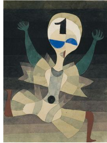
Fig. 3. Paul Klee Surrealist Painting.

freedom of expression and less restriction of times for designers. 5