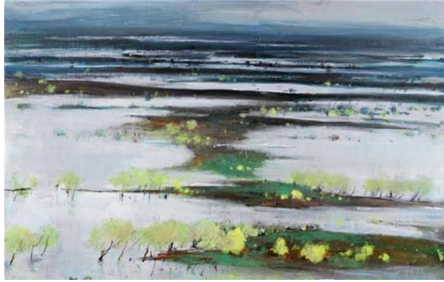
Figure 1. The work “a year of green grass” by Su Tianci