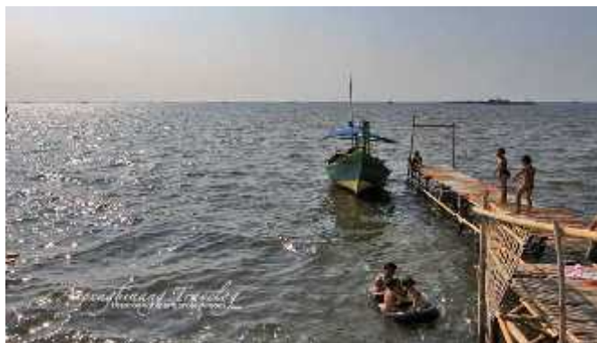
Fig. 2. Activities in Kampung Nelayan Marunda.

Kampung Nelayan Marunda offers a quiet atmosphere, away from the crowd of Jakarta. Besides that, it has been disgusting for many years for its pollution. Kampung Nelayan Marunda still attracts tourists from outside Jakarta despite their heavily polluted water. Jakarta's coastal area has rapidly deteriorated in the last few years.