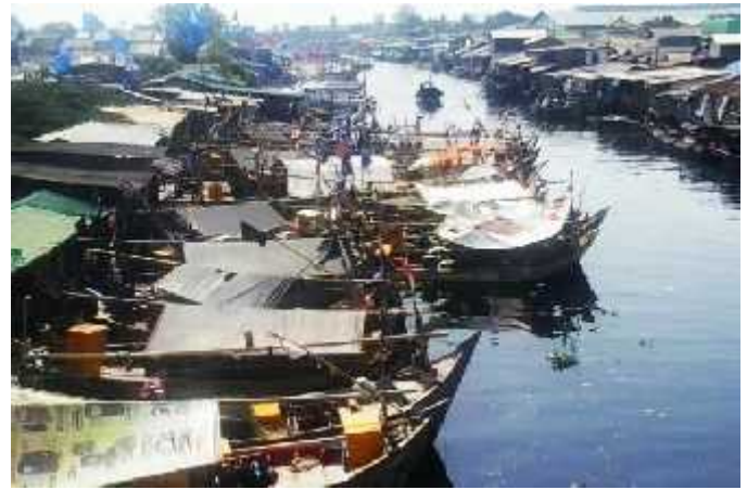
Fig. 1. Kampung Nelayan Marunda.

Kampung Nelayan Marunda, which located in Administrative City of North Jakarta is a potential area for tourist attraction, that might be able to promote a number of human resources. By its geographical location, the rural area from Kampung Nelayan Marunda has a diversified tourism potential, provided by the contrasting natural environmental factors, natural areas, cultural, historical, religious sites, as well as multicultural local customs and traditions of the rural area. This potential can be used under various forms in the rural area: cultural tourism, historical tourism, religious tourism, fishing tourism, as well as other kinds of rural tourism.