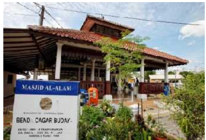
Fig. 3. Al-Alam Mosque.

Kampung Nelayan Marunda which not far from Marunda beach is located near to a cultural heritage, Al-Alam Marunda mosque that is known as the oldest mosque in Jakarta. The building was a legacy of Sultan Agung, when Batavia was attacked. Muslims visitors can pray at the heritage mosque Al-Alam near the beach, where many residents believe Pitung, a Betawi hero during the Dutch colonial era, used to pray. However, Marunda today is just a portrait of Jakarta displaced coastal area.