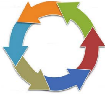
Fig. 2. Teaching reform measures in higher vocational colleges

In the process of reform, higher vocational colleges can choose the teaching methods reasonably from the above contents, and fully mobilize the students' subjective initiative and improve the students' learning efficiency, which has a very good promotion effect on students' professional electronic skills. The current teaching process, teachers can use the following teaching techniques to create a good learning atmosphere. In the process of implementing the teaching method, teachers should regard the students as the main body of the electronic technology course, make clear their own guiding significance, take the students' 'electronic vocational skills training as the reference point, and make the students' guide students to actively into the classroom. Vocational colleges in the course of setting up electronic technology courses practice from the student career development direction to career development as the main content, make full use of school resources and social resources for students to create a good training platform.