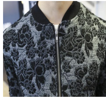
Fig. 3. The use of lace in men’s upper garment

3) Flexibility : Flexibility in the design of men’s wear means no conventionality and unconformity. The clothing design can be in an unrestrained and vigorous style without any ideological bondage, breaking the restraints of the previous design mode, boldly and flexibly design men’s wear in material, color, match and so on. By breaking the stereotyped mode and design style, innovative thinking promotes the multi-angle, multi-layer and multi-direction development trend in the design of men’s wear. Through the application of innovative thinking, the designer effectively integrates things that cannot be combined or with no relationship to serve for the design of men’s wear, forming a new representing mode in the design of men’s wear. Following the trend of Punk Movement, the designer catches people’s thinking of following the trend and their consciousness of imitation, and thus designs “rag look” punk clothing, also known as “beggar clothing”, which greatly changed people’s fixed opinion towards the beauty of clothing and redefined people’s aesthetics towards clothing.