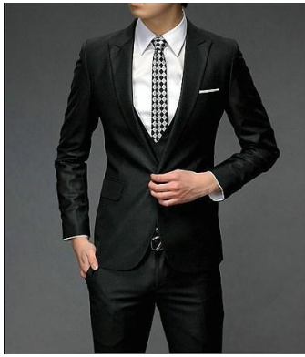
Fig. 6. Korean style suit

3) Imagery thinking : Imagery thinking is the thinking activity that relying on the image of a certain thing in one's mind, analyze, abstract and conclude the image and finally illustrate it. This kind of thinking is more basic compared with other innovative type. Therefore, it has been widely used in the design of men's wear for a very long time. The clothing designer forms a complete generalization and image feature in his mind according to his recognition and understanding of things in real life, and then transfer these images and features into clothing through the design method. For example, the leopard print clothing, fur clothing, flower pattern clothing in men's wear, etc.. "Fig. 7", "Fig. 8"