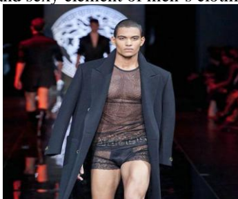
Fig. 2. The use of lace in underwear

2) Uniqueness : One feature of innovation is uniqueness. In the design of men’s wear, innovation should be special, initiative and unique, leading the fashion of men’s clothing through innovative thinking. That is to say, the innovation of the design of men’s wear should be reflected in its uniqueness, which is not a slight change to the clothing, but create a special design type or way on men’s clothing by the innovative thinking. For example, lace is commonly used in women’s formal dress and wedding dress, and it is also used in the clothing design of the noble class in western countries, but it is rarely used in the design of men’s wear in China. However, in recent years, lace has been used in the design of men’s wear and developed fast along with the bold innovation of the design of men’s wear. Lace stitching and lace jacquard can be found in the design of men’ shirt, formal dress and underwear “Fig. 2” and “Fig. 3”, which greatly increase the fashion sense and sexy element of men’s clothing.