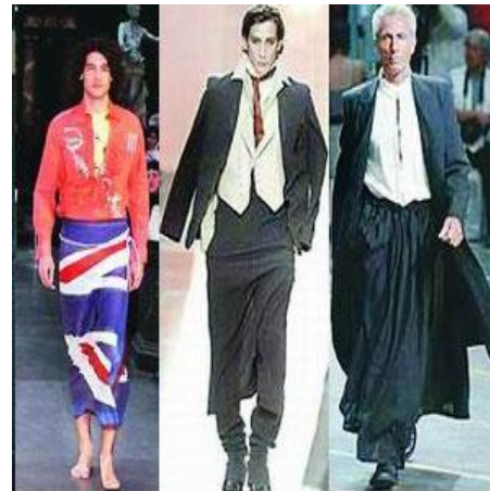
Fig. 5. Men's skirt is the representation of reverse thinking

2) Convergent thinking : Compared with divergent thinking, convergent thinking gathers all kinds of external information together and makes breakthrough in a certain aspect. As in the design of men's wear, convergent thinking means selecting a major part in the design to make the breakthrough, such as the shirt, trousers, upper wear, and waistcoat and so on. For example, in the design of suit, the "Korean Style" "Fig. 6" of lighting and thinning, tight and simplified for the coat of suit and the slim cut jeans are the examples of concentrating on a certain aspect to make detailed research and careful design to realize the various design of clothing, and thus satisfy the multi needs of the customers.