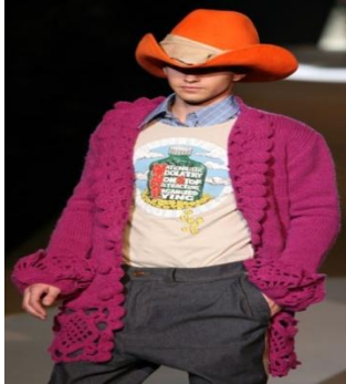
Fig. 1. Bright and thick sweater match

1) Novelty : Innovation is firstly represented in “new”. In the design of men’s wear, innovation is a novel, special and unconventional representation. Innovative thinking requires that the process of the design of men’s wear cannot be done in the original thinking mode, design ways and mode, but to make bold innovation on the traditional men’s wear or the popular clothing from a novel angle, aiming to design the cloth that captures people’s eyes. For example, men’s wear tends to be more neutral at present, and many men like fashionable and light clothing. Therefore, many designers apply the thick sweater material and bright color to embellish the collar and other important parts of men’s wear or to change the overall match “Fig. 1”, creating many classic examples of innovative design of men’s wear.