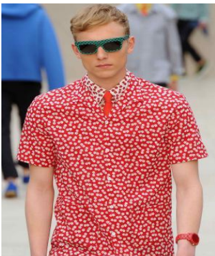
Fig. 8. Flower pattern clothing