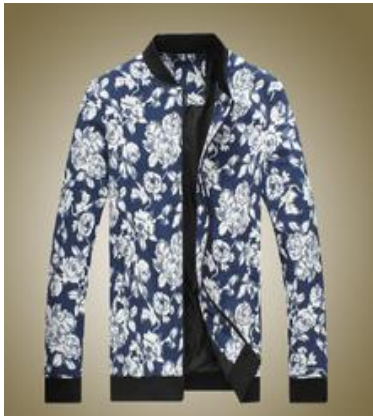
Fig. 4. Elements of blue-and-white porcelain in the design of men's wear