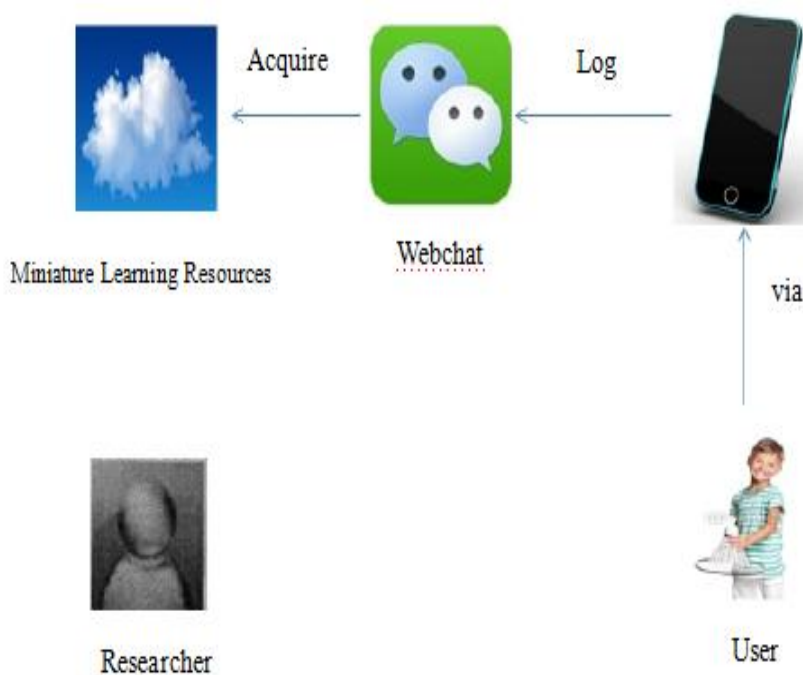
Figure 2. Miniature Learning Resources Learning Test Chart