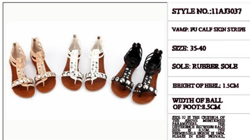
Picture 1The Major Details of 11AJ3037

Then the pictures should be taken. High-qualified light can make picture clearer, so the light in the studio should be adjusted to the best condition before shooting. The focal distance of the camera should focus on the brightest shot of the shoes (as is showed in picture 1, the main bright shots are rivets, the hand-weaved stripes and so on). On the TMALL page, the first picture customers see is window display picture (every view point should be showed in the picture). So every view point of the shoes for shooting should be set while shooting. The main view points of shoes are: 45-degree, toe cap to left, toe cap to right, hell, vamp, sole, 45-degree of every color and the integrated picture of every color. It is showed in picture 2. The shoes in the pictures are 11AJ3037.