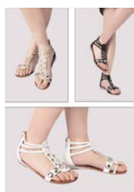
Picture 4 Picture with Model