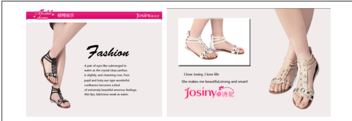
Picture 9 Pictures with Models

To offer agreeable shoes for customers, we should inform the indeed sizes for customer, the brand stories of Josiny, and the buying criteria. The content of the buying criteria should contain the following information: the issues about goods delivering, the issues that required attention while signing the shoes. The conflicts between customers and couriers and complains of shops' issues of honesty may be caused because the customers don't know the buying criteria. The following 3 pictures showed in Picture 10 should be added to offer tips that called by a joint name kind remind.