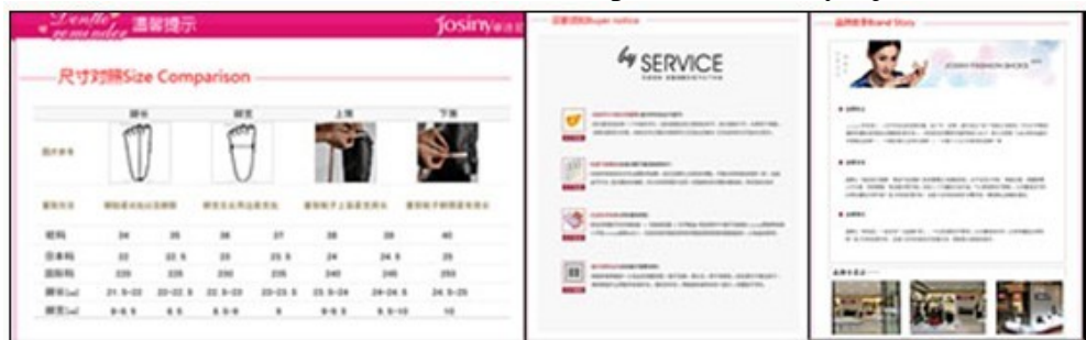
Picture 10 Kind Remind

To offer agreeable shoes for customers, we should inform the indeed sizes for customer, the brand stories of Josiny, and the buying criteria. The content of the buying criteria should contain the following information: the issues about goods delivering, the issues that required attention while signing the shoes. The conflicts between customers and couriers and complains of shops' issues of honesty may be caused because the customers don't know the buying criteria. The following 3 pictures showed in Picture 10 should be added to offer tips that called by a joint name kind remind.