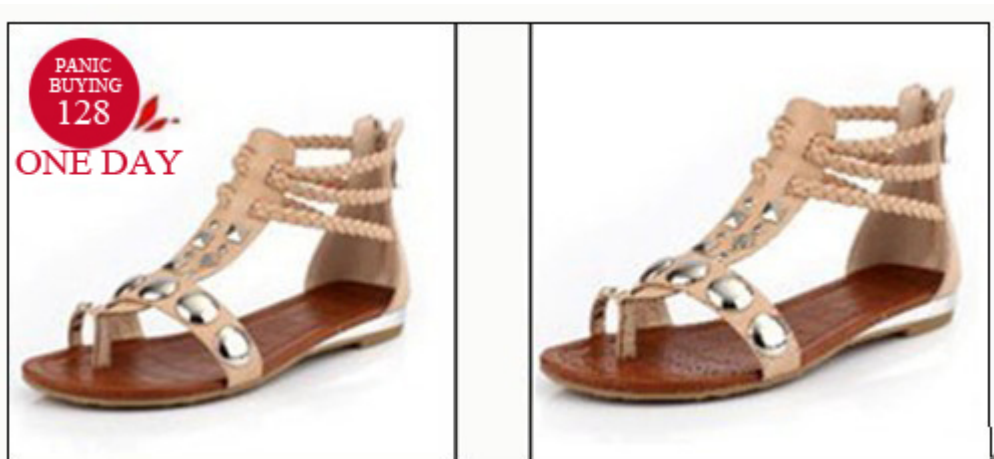
Picture 11 The Window Display Picture During Activities and the Usually-showed Window Display Picture