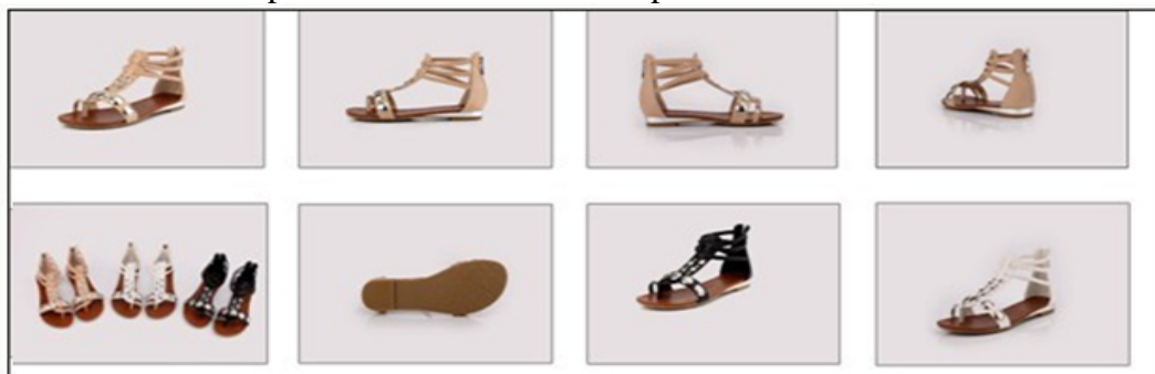
Picture 2 Window Display Picture

Then the pictures should be taken. High-qualified light can make picture clearer, so the light in the studio should be adjusted to the best condition before shooting. The focal distance of the camera should focus on the brightest shot of the shoes (as is showed in picture 1, the main bright shots are rivets, the hand-weaved stripes and so on). On the TMALL page, the first picture customers see is window display picture (every view point should be showed in the picture). So every view point of the shoes for shooting should be set while shooting. The main view points of shoes are: 45-degree, toe cap to left, toe cap to right, hell, vamp, sole, 45-degree of every color and the integrated picture of every color. It is showed in picture 2. The shoes in the pictures are 11AJ3037.