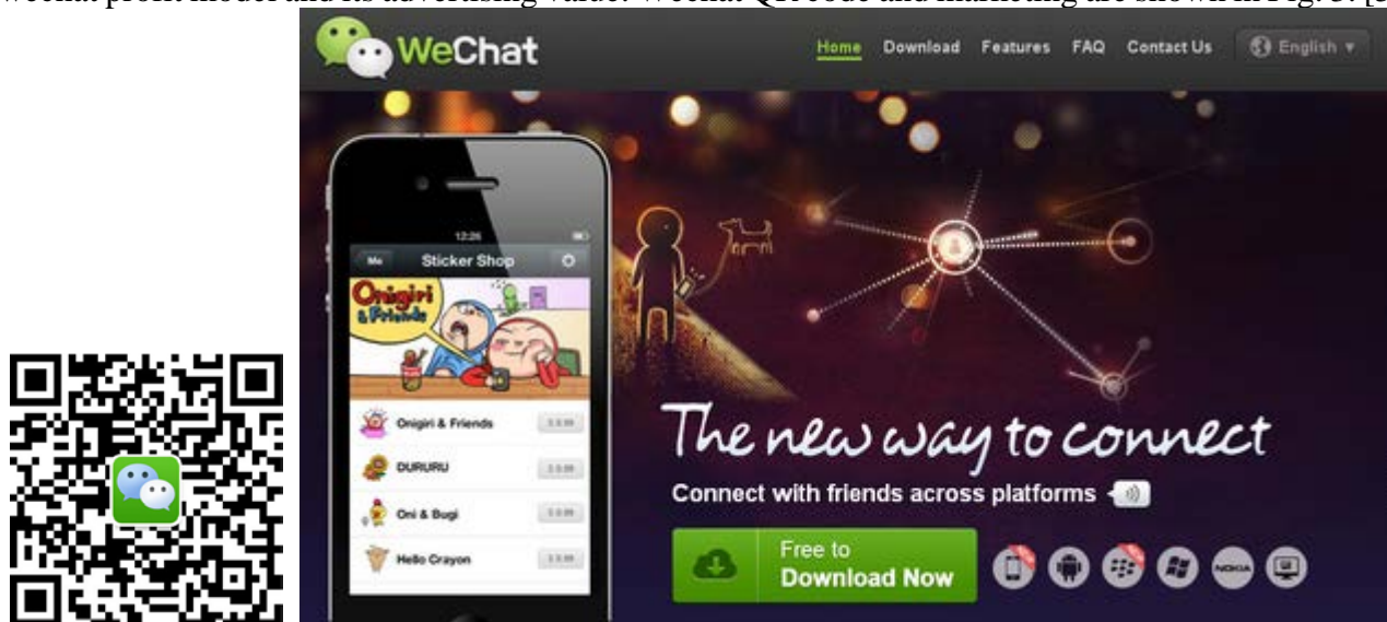
Fig. 3 Wechat QR code and marketing

The rapid development of the science and technology creates the rapid prosperity of the new media economy. In the mean time, the popularity of the mobile instant messaging application products dramatically change the way people's daily life interactions, and it quickly grows into a very popular emerging industry with a new look. Among them, Wechat, as a typical representative of the mobile Internet instant messaging product, not only brings the enormous social value and spread value, but also contains a very considerable commercial value. But now, the profit model of wechat and its similar products is not perfect, even though there are huge user groups and a vast amount of information flow, wechat and its similar products are faced with the bottlenecks of the business model innovation and marketing innovation means of communication. Therefore, in the terms of wechat or its similar products, there are important theoretical and practical significances in the research on the wechat profit model and its advertising value. Wechat QR code and marketing are shown in Fig. 3. [5]