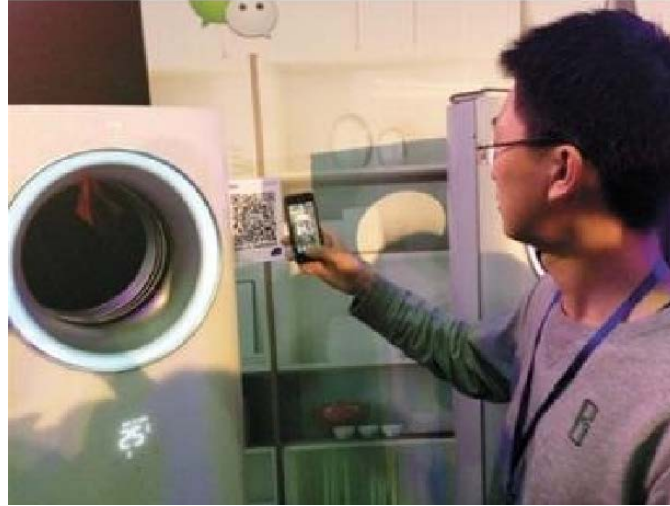
Fig. 4 Wechat business