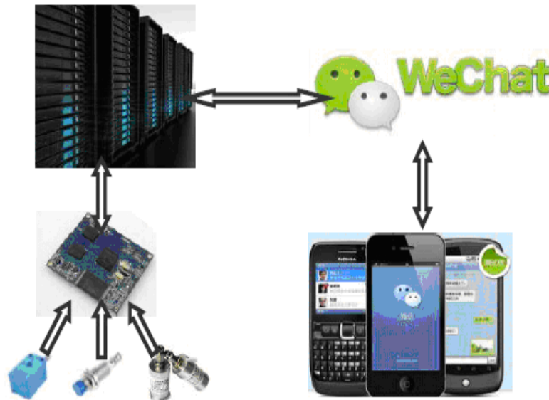
Fig. 1 The dataflow in the system

WeChat is a product of mobile internet provides instant messaging (IM) for the mobile client and the internet sever. It is a platform integrates text message communicate, voice messaging, broadcast (on-to-many), picture or location sharing and the exchange of contact information subtly [4]. Until now, WeChat have had the number of user more than 300 million users, indicating that it's a successful social Via location-based functions like 'Shake', 'Look Around', 'Drift Bottle' and so on WeChat can easily get user's information and know what they may need, and profit from the internet and the cloud technical, this requirement, if is indeed, can be instantaneously sent to every corner of the world. Besides, WeChat platform also provide an opened, convenient entrance for all users, which means every individual can have their own WeChat account on the platform whenever they want. By linking amount of all these users, WeChat platform construct a large network of social communication, actually this is the reason why we choose WeChat platform as the important node of our framework of wechat as well as the essential instrument to get the request and reply from the user. The dataflow in the system is shown in Fig.1.