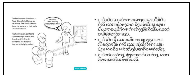
Fig. 2. Picture two in Unit 7

For the intervention, the targeted Laotian teachers will read the 20-unit story which is uploaded onto a Facebook social learning group. Facebook is chosen as the e-learning platform as it is the most common online social media used by the