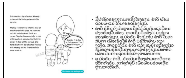
Fig. 1. Picture one in Unit 7

The second stage in the ADR model encompasses the BIE cycle: building of the artifact (B), intervention in the sample population (I), and evaluation (E). The outcome of the BIE cycle(s) is the design of the artifact [15]. In this project, the artifact is the teacher training module called “The Story of Khamdy” which was designed using the pictorial narrative approach. The 20 units of the module, begin with the birth of Khamdy and follow Khamdy’s developmental journey till he graduates from primary school. Each unit includes eight to 10 illustrations of specific techniques used by Khamdy’s parents and teachers to support Khamdy’s learning and to provide an inclusive environments to him. Figures 1 and 2 show the examples of two illustrations in Unit 7: Khamdy’s New Routine. In this unit, Khamdy just entered kindergarten and the storyline is about how his preschool teacher, Teacher Bounvanh helps him to be familiar with the learning environment in the kindergarten.