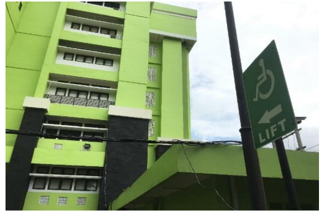
Fig 7. Accessibility signs and symbols at Educational Medicines Building (Documentation of the researcher; taken at January 25 2019)

Accessibility signs and symbols are located in 5 spots. In figure 7; shows one of the spot of accessible signs and symbols in Medical Faculty. The distribution of signs and symbols are in the good condition; however; the distribution of signs and symbols still has not covered all of the area at UNS. Those signs and symbols are only found in certain spots; not in every corner of space at UNS.