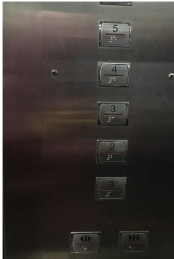
Fig 5. The special button of braille at Graduate School (Documentation of the researcher; taken at April 30 2019)