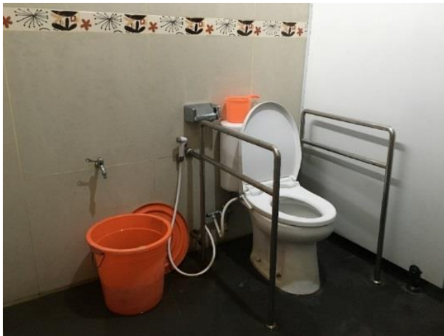
Fig 6. Disability Toilet at Rectorate Building (Documentation of the researcher; taken at January 25 2019)

The researcher found out the there are only two disability toilets at UNS. The spots are on Rectorate Building and Faculty of mathematics and science education building C second floor. The disability toilet is accessible but they are only available in that particular places. It is very unfortunate because there are many buildings at UNS. Even there is no disability toilet at public spaces.