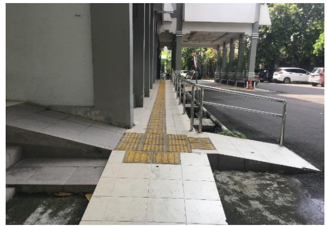
Fig 3. The accessible path in Academic Centre at UNS

The researcher only found 6 spots of accessible path in UNS. Those 6 spots are in the first floor of Rectorate; Academic Center; Faculty of Engineering Building Number 2; Building of SPMB; Building of Porsima and Graduate School Building. Those accessible path are good because the shape of floor tile is exactly place and equipped with handrails .