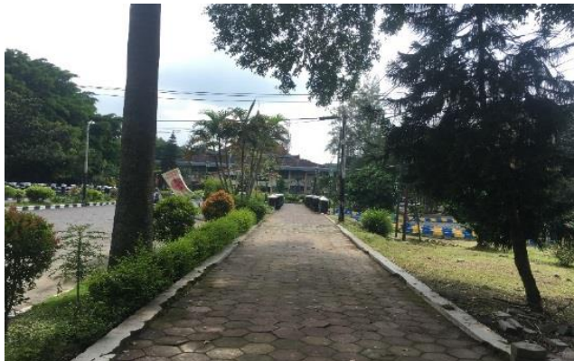
Fig 2. Accessible pedestrian path in the front of SPMB Office UNS (Documentation of the researcher; taken at April 30 2019)

The accessible pedestrian path in UNS can be found in some spots. However; several paths are need repairments. For example in the front of Kantor SPMB; the wide of path is about 275 cm; with the edge about 10 cm and neat floor tale.