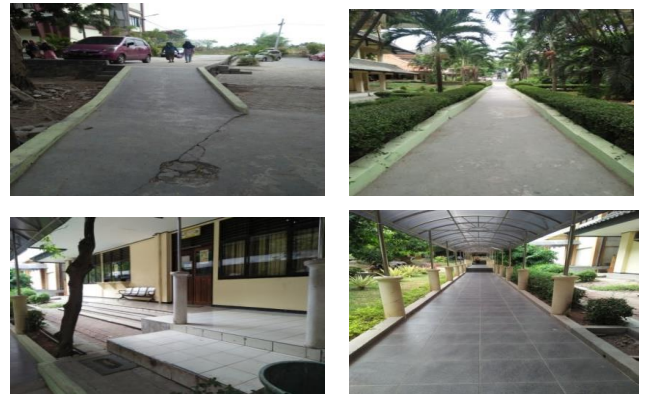
Fig.4. Environmental Campus Faculty of Education, State University Surabaya

the campus Faculty of Education, State University of Surabaya.