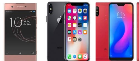
Fig.2. Mobile Android in Audio Program Orientation Mobility Model Social and Communication