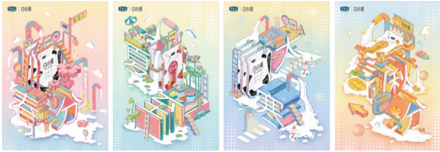
Figure 3.3D Chinese character and graphic poster: spring, summer, autumn and winter (author's own creation)