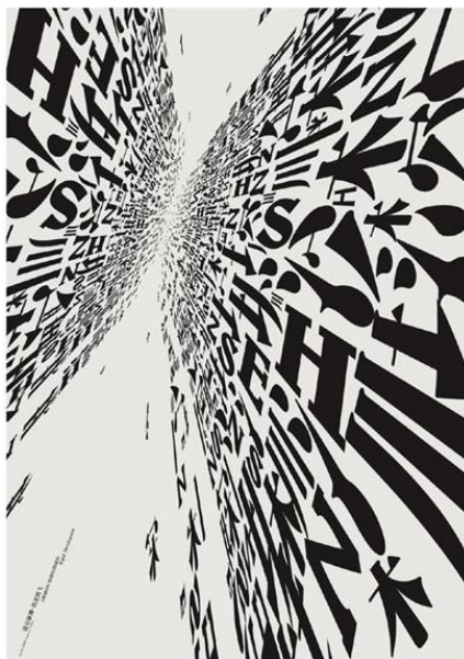
Figure 4.Gradient Grid Poster

grid skeleton requirements, through the text strokes (radicals), the size of the cross-arrangement of the grid, the grid gradient caused by the gradient of the text size, the overall dynamic characteristics and the sense of illusory space, to form a strong visual impact.