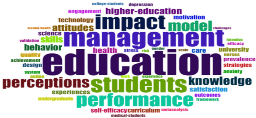
Fig. 2. Keywords cloud