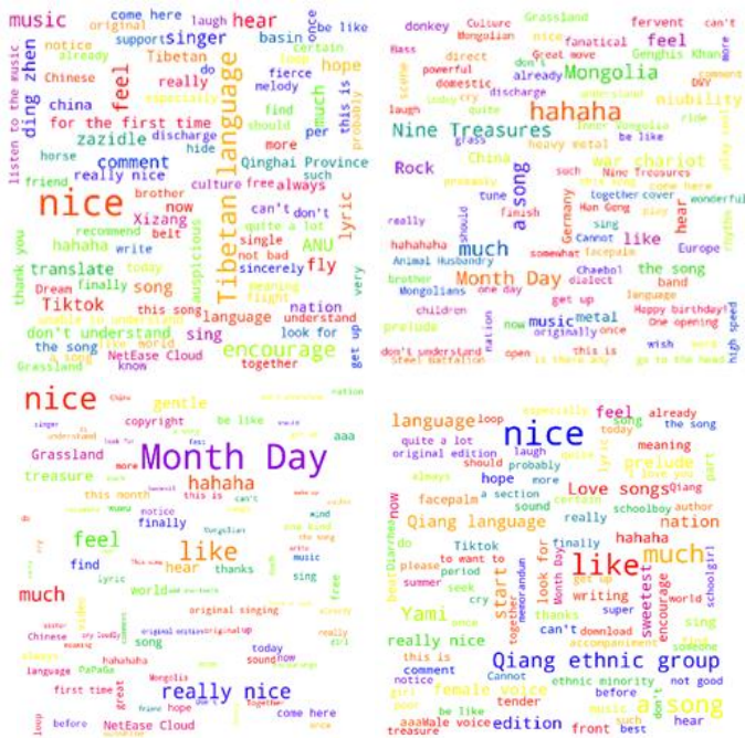
Fig. 2. word cloud map of "FLY ""Tesi River ""Wake" and "Yami"

In terms of sample selection, we have chosen the online comments from the four ethnic songs, namely "Fly," "Praise of the Tesi River," "Yami," and "Wake" released on