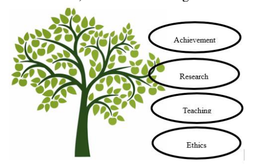
Fig. 3. Ability model for vocational undergraduate teachers

If we were to liken vocational undergraduate teachers to a tree, vocational ethics would be the roots, teaching development and implementation capabilities would be the trunk, research and social service capabilities would be the branches and leaves, and the ability to summarize and refine teaching and research-related achievements would be the flowers and fruits of the tree, as illustrated in Figure 3.