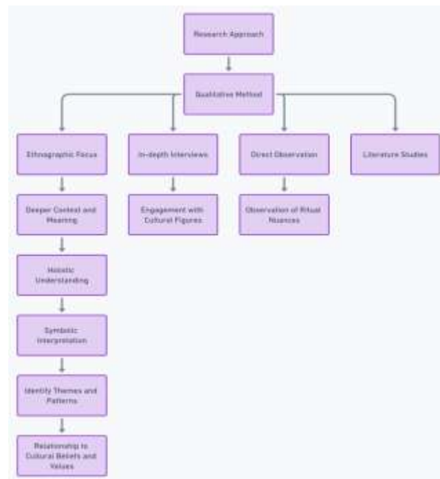
Figure 1. Flow and Research Method

Approach used in this research is qualitative , with focus on method ethnographic[11] . This method is selected Because can disclose more context and meaning deep from tradition Padalan Porsa in culture Simalungun . Through approach qualitative , researcher Can get more understanding holistic about this tradition , dig elements possible symbolic No seen with method quantitative . With this approach , researchers can understand and interpret the meaning behind symbols and actions that occur during the ritual.