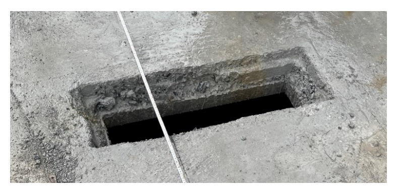
Fig. 5. Reserved Hole

Finally, concrete structures built using aluminium formwork are required to have a hole reserved on the slab of each floor that facilitates the upward transfer of the aluminium components (see Figure 5). This hole allows workers to pass the disassembled aluminium formwork to the upward floor. This design reduces the over-dependence on construction equipment and lifts.