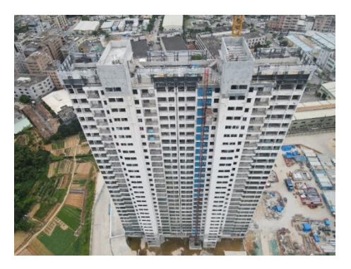
Fig. 6. Building after Disassembled all Aluminium Formwork