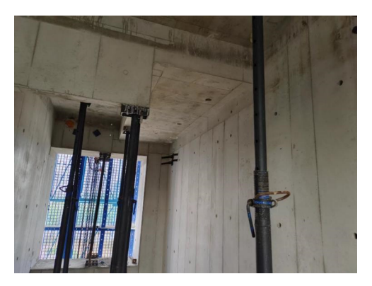
Fig. 7. Secondary Structure

The project's construction requirements emphasise high quality and high construction efficiency. Although the conventional aluminium formwork improved construction efficiency in assembling and manufacturing panels, it still involves two stages of concrete pouring separating the primary and secondary structures. This approach requires that the installation and pouring for secondary structures only commence after the primary structure is completed, suggesting significant potential for enhancing the efficient construction process. However, the innovation of The Great Bay University Project is using aluminium formwork by simultaneously casting both the primary and secondary structures. This method not only utilises the benefits of aluminium formwork but also introduces an innovative approach to its application.