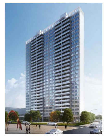
Fig. 1. Design Overall Layout [18]

for the Guangdong-Hong Kong-Macao Greater Bay Area in 2019[17]. Additionally, the expected start date for enrolment at the Great Bay University is September 2024[17]. This short construction schedule has prompted the construction of twenty-eight floors within a 1.5-year construction period, with completion before the school's operations. The school's recruitment office requested the provision of 108 apartments (see Fig. 1). Each floor is designed to accommodate four apartments. Therefore, a construction method and tool capable of quickly completing the main structure of the buildings are required. After considering factors such as economy, environment, and construction efficiency, the architects decided to use aluminium alloy formwork to construct the main structure of the building.