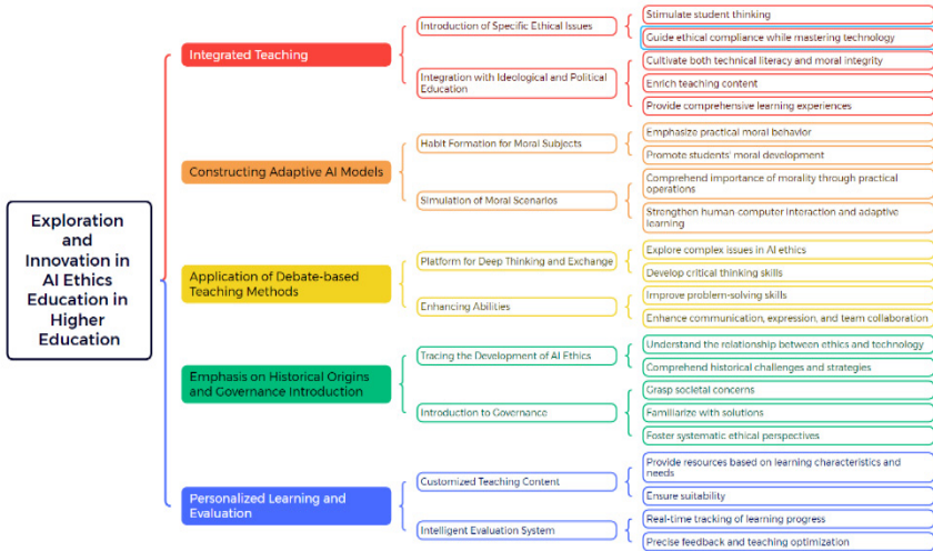
Fig. 2. Exploration and Innovation in AI Ethics Education in Higher Education