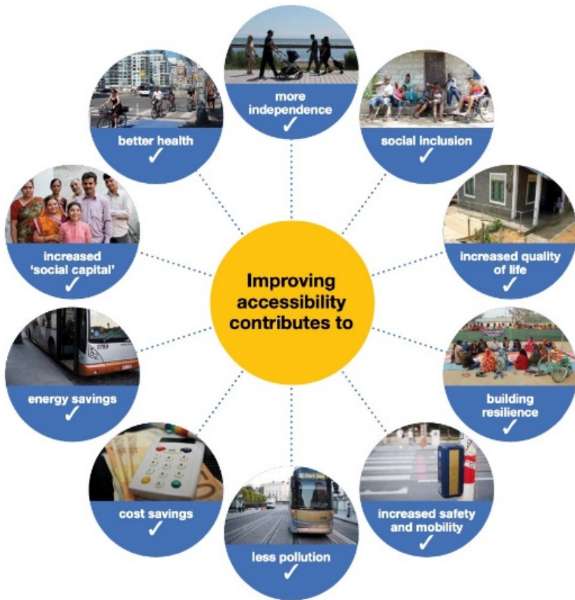
Fig. 1. Improving accessibility contributes. From CBM, & Enable, W (2017) “The Inclusion Imperative Towards Disability Inclusive and Accessible Urb”.

The concepts highlighted here converge towards a sense of spatial justice—something emphasized by Soja [13] as an ideal to be achieved, aiming to correct inequalities and promote territorial equity and inclusion.