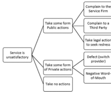
Fig 1. Classification of Consumer Complaint Behavior

There are various definitions of "complaint" because a complaint expresses customer dissatisfaction with the company [4]. When a customer experiences a service failure, the actions taken by the customer can be very broad and varied. Customers can complain to the company, complain to third parties, move to other services, and tell others about their dissatisfaction experience (Word of Mouth), or customers can also not take any action [5].