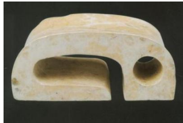
Fig. 2. Jade belt hook found in Liangzhu culture