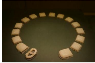
Fig. 8. Tang Dynasty Jade Belt