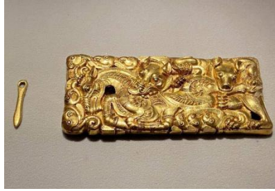
Fig. 5. Northern Band Hook of the Spring and Autumn and Warring States Periods

With the application of the belt hooks and belts, the emergence of the hooks and belts (also known as Guo Luo belt) that is, with the belt hooks will be linked together at both ends of the belt. The late Spring and Autumn period, and the emergence of the belt buckle, its function and belt hooks, belt with the function of both ends of the belt will be fixed together (Figure), the belt buckle in the Han Dynasty ushered in the development of the heyday of the different shapes, exquisite craftsmanship, widely used, and became a necessity for people. [10] During the reign of Emperor Wen of the Han Dynasty, Emperor Wen wore a "red ribbon". A group of ribbons was worn on top of the robes, the color of the ribbons indicating the level of status, to which purple ribbons and above could be added jade rings and belts. [11]165 To summarize, the belt and its belt tool during the Shang, Zhou, Qin and Han Dynasties not only have practical and decorative roles, but also have the role of reflecting the wearer's identity and status, and show significant differences between the north and south. There was a systematic development in the types of belts and structural components of belts, which laid the foundation for the development of belts in later generations.