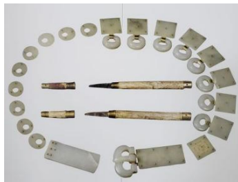
Fig. 6. Northern Zhou Jade Bow Belt

It can be seen that the widespread use of jade belts in the Tang and Song dynasties, as well as in the later Yuan and Ming dynasties, was the result of the role of many parties, one of which was that the integration of ethnic groups during this period accelerated cultural exchanges between the Central Plains and the rest of the world, absorbing new belt styles. The second was the gradual introduction of high-quality jades into the interior with tribute and trade. Thirdly, under the influence of the ceremonial system since the Shang and Zhou dynasties, jade has always been a symbol of status.