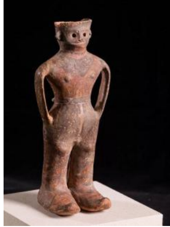
Fig. 1. Yangshao culture human-shaped colored pottery jar