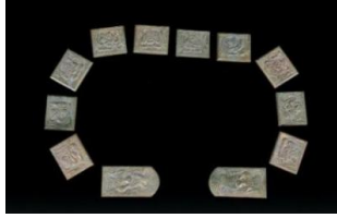
Fig. 7. Tang Dynasty Hu Ren Pattern Jade Belt