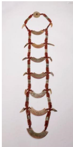
Fig. 3. A set of jade pendants during the Warring States period

Clearly stipulates the requirements of different classes of wear. [4] The system of wearing ribbons changed in the Han Dynasty, and the "Records of Public Apparel" recorded that the system of wearing ribbons in the early years of the Han Dynasty was "to wear double seals, two minutes in length and six minutes in square. The marsupials, vassal kings, princes, and marquises used white jade, while those below the middle two thousand stones up to four hundred stones used black rhinoceros, and those from two hundred stones up to private disciples used ivory." [5] It can be seen that the Han Dynasty distinguished the grade of the wearer by the length of the pendant and the texture of the item suspended. During the Western Zhou, Qin and Han Dynasties, peiyu no longer appeared as a single jade pendant, but as a group pendant, which was a combination of several pieces of peiyu suspended in colorful groups on a leather belt by, Juan, Ju, Wang Yu, Chong Ya and other parts, in the shape of a belt, hanging down from the waist. [1]237 The group pei also appears in the emperor statues after the Qin and Han dynasties, with a relatively long period of continuity (Fig. 3). Thirdly, the structural components of the belt are shown in the structural parts of the belt, and the parts of the belt that are more intensively studied from the Western Zhou to the Qin and Han periods are the belt hooks and the belt cuffs.