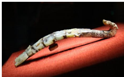
Fig. 4. Tomb Band Hook of the King of South Vietnam, Qin and Han Dynasties