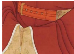
Fig. 9. Belt of Southern Song Dynasty Emperors in Nanxun Hall

Except for leather belts, cloth and silk belts still developed during this period. Starting from the Song Dynasty, some belts with completely identical shapes and structures to the original leather belts had already been made entirely of cloth. During the Yuan, Ming, and Qing dynasties, tapestry became the mainstream belt in social life. [1]521 During this period, special belt accessories also appeared, such as the belly hugging belt. The belly hugging belt is one of the specially shaped belts, commonly known as the "belly wrapping", also known as the "belly wrapping" or "robe belly", which was a type of decoration worn by men around their waist in the Song Dynasty. There was also a belly wrapped structure in clothing during the Jin and Liao dynasties. [6]524 In summary, from the Wei, Jin, Southern and Northern Dynasties to the Yuan Dynasty, the development of belts in China showed a characteristic of mutual integration between the north and the south. On the one hand, the Central Plains Dynasty further absorbed the belt styles of northern ethnic minorities and redesigned them according to their own living needs. These belt styles then flowed into the northern ethnic minority areas with the exchange between the two sides and gained their recognition. At this point, the components of the belt and the use of color as a symbol of identity and status are further enhanced.