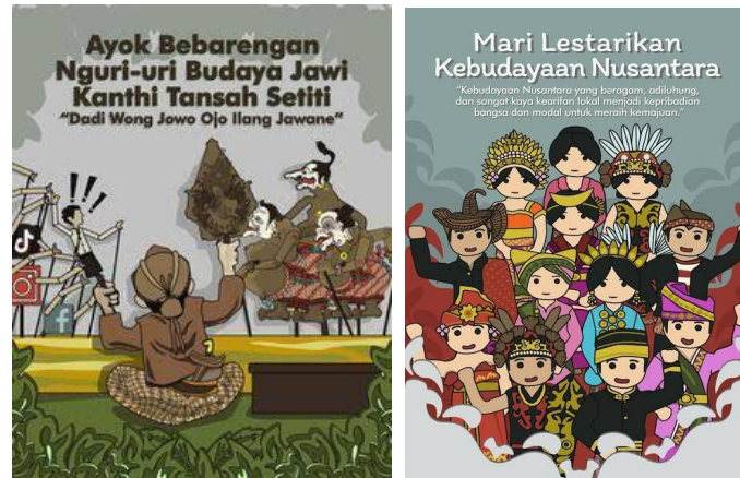
Picture 2. The form of persuasive speech acts in the directive category can be seen in the following data