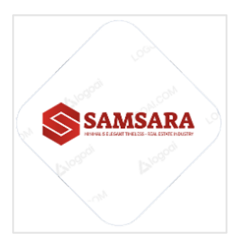
Figure 3 - AI Logo Design (LogoAI.com)

Additionally, the research conducted a visual comparison of logo designs between AI and human (Photoshop) approaches, revealing distinct differences in design style, color scheme, versatility, memorability, and emotional impression, providing a comprehensive understanding of the unique characteristics each approach brings to brand communication. The AI-generated logos, created using LogoAI.com, exhibited a clean and modern design, emphasizing professionalism, with a color scheme of red and white for eye-catching and memorable aesthetics. In contrast, the logos generated by human designers using Photoshop showcased a minimalist and modern style, reflecting simplicity and elegance, with a color scheme of gold and black, creating an elegant and contrasting look.