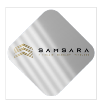
Figure 4 - Human Logo Design (Photoshop)

This comparative analysis extended to the aspects of versatility and usability, where AI-generated logos were designed for easy application in branding and marketing materials. On the other hand, logos designed using Photoshop demonstrated versatility and practicality, suitable for various contexts and media. The examination of memorability indicated that while the simplicity of AI-generated logos could raise concerns about memorability and distinctiveness, the minimalist approach of Photoshop logos might face similar challenges.