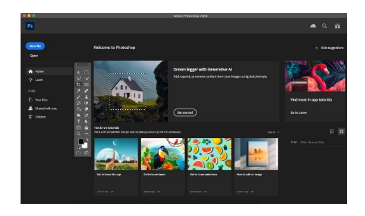
Figure 2 - Human Graphic Designer Using Software Photoshop