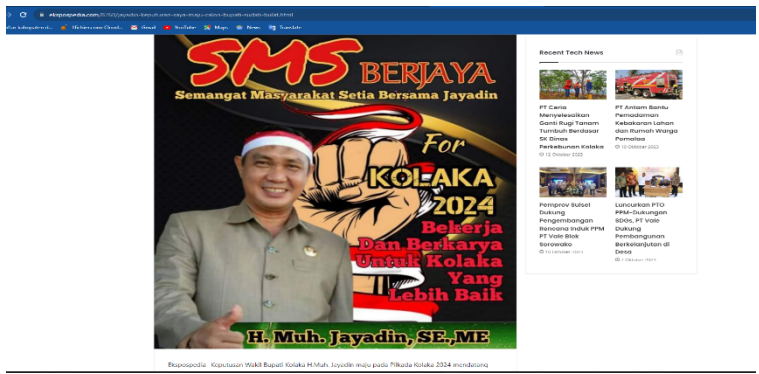
Fig. 2. Jayadin, Regency Candidate of Kolaka 2024, on online media 2023

In this photo, the denotational meaning is that the Kolaka regent candidate, HRS, is posing with his hand raised to the side with five fingers, using red uniforms that symbolize one of the parties. The denotational meaning in this photo can be that the photographer took a picture with an object on the front with a black background so that the red uniform stands out in branding HRS as a candidate for the regent of Kolaka 2024. Most HRS photos in online media and billboards use a salute or 5-finger salute, as above.