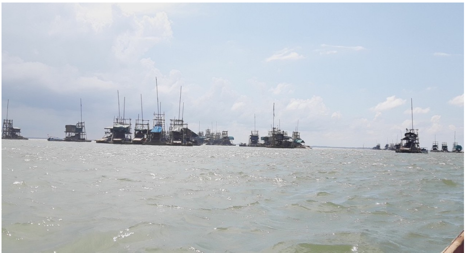
Fig. 1. Illegal mining in Kelabat Dalam Bay.

“The Kelabat Dalam Bay area used to have white sandy beaches and relatively clear waters, and of course, the catch for fishermen in the sea was still straightforward because the marine ecosystem was still maintained, but since the presence of mining, both legal and illegal, the water that was once clean has become cloudy, clean sand, even turning into mud, coupled with increasing amounts of rubbish, ultimately causing marine products to decrease due to damage to the ecosystem in the Kelabat Dalam Bay marine area.”