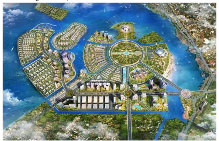
Picture 1. Master Plan Citraland City Losari Makassar City, South Sulawesi, part of reclamation plan in Laelae Island

Island to improve community welfare through the tourism sector. But in its development, the reclamation plan on Laelae Island was rejected by the local community. Although the reclamation plan on LaeLae Island will be implemented in an area where there are no settlements, the community's rejection of the reclamation plan is still ongoing. The rejection is also supported by several environmental-based non-governmental organizations, one of which is WALHI South Sulawesi.