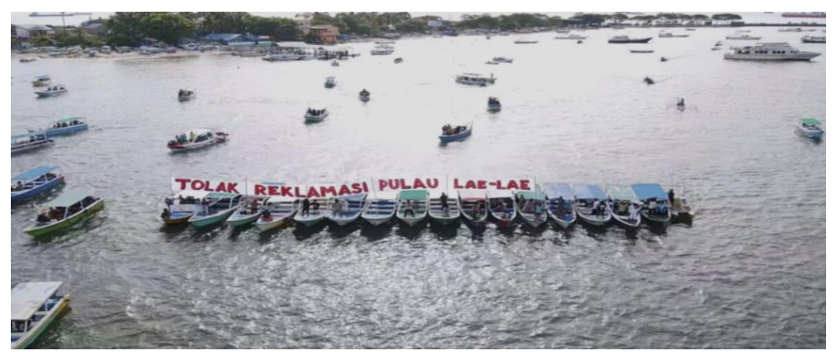
Picture 4 & 5. Environmental Campaign Against Laelae Island Reclamation With Local Communities