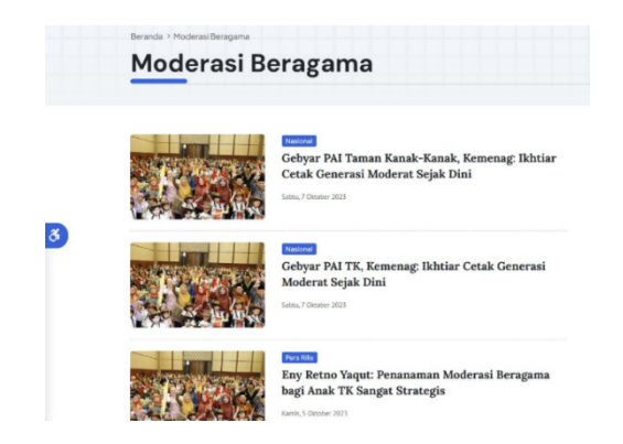
Fig. 1. Kindergarten PAI event, Ministry of Religious Affairs: An Effort to Raise a Moderate Generation from an Early Age, Source: kemenag.co.id.

The Ministry of Religious Affairs website features a lot of religious moderation content ranging from socialisation activities from kindergarten to university level.