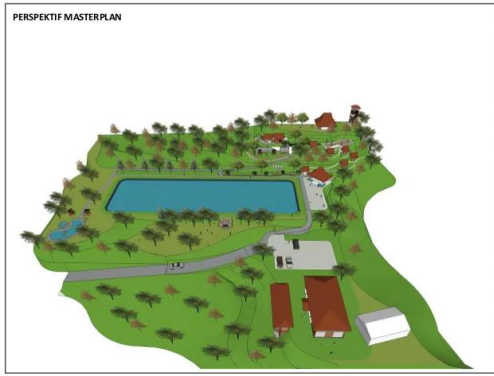
Figure 4 Seboro Village Masterplan with pond and longan plantation.