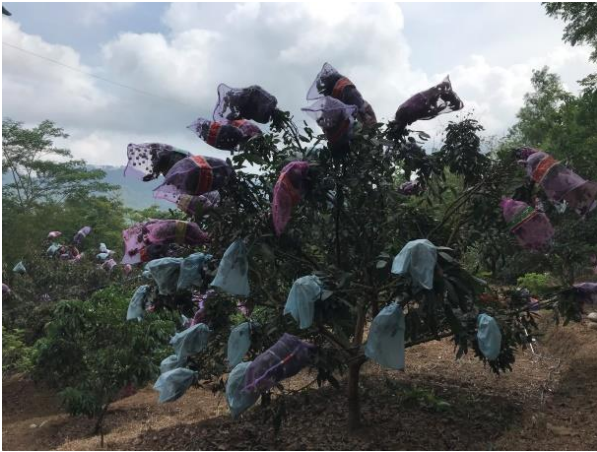
Figure 2 Longan garden in Seboro Village.