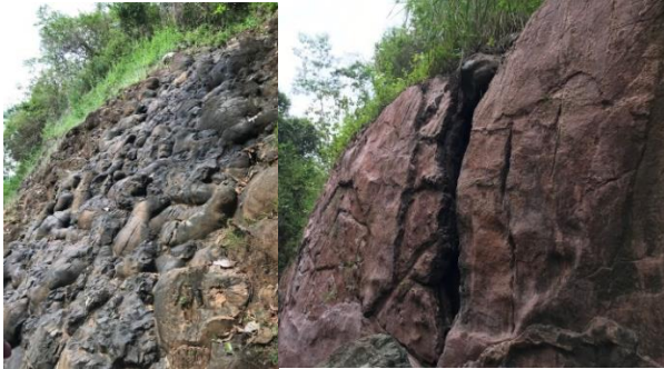
Figure 1 Pillow Lava geological site in Seboro Village

River. There, too, we can see and feel the shape of rocks from the ocean floor which are not many in the world. However, Seboro has 75% of all similar rocks in Southeast Asia, namely Pillow Lava rock (or commonly called watu kelir by local people) [16]. Because of their rarity and exclusivity, the rocks in Seboro Village are of international value and bring geotourism visitors who want to study at the BRIN geological study center and also visit the rock outcrop center in Seboro.