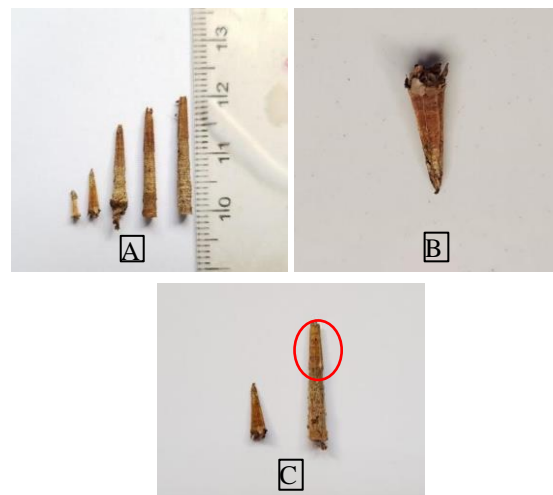
Figure 1. Morphological character of M. conglacia . (A) size different from the young to adult instar, (B) deeply ribbed and cone-shaped (C) comparison of the young and old bag.

Generally, bagworms are pests in the immature stages. The larva type is eruciform with a welldeveloped and scleritonized head and thoracic legs [8, 14]. They are characterized by the possession of cases, which they inhabit throughout their development. It begins to build the early case as soon as it hatches. The case was constructed from the part of the leaflet. Bagworms add material to the front of the case as they grow, excreting waste materials through the opening in the back of the case [14]. When it becomes an adult, only adult males ever leave the case to flight to find a mate. The adult males are small, dull-coloured and possess wings. Most species are strong fliers with well-developed wings and feathery antennae [15].