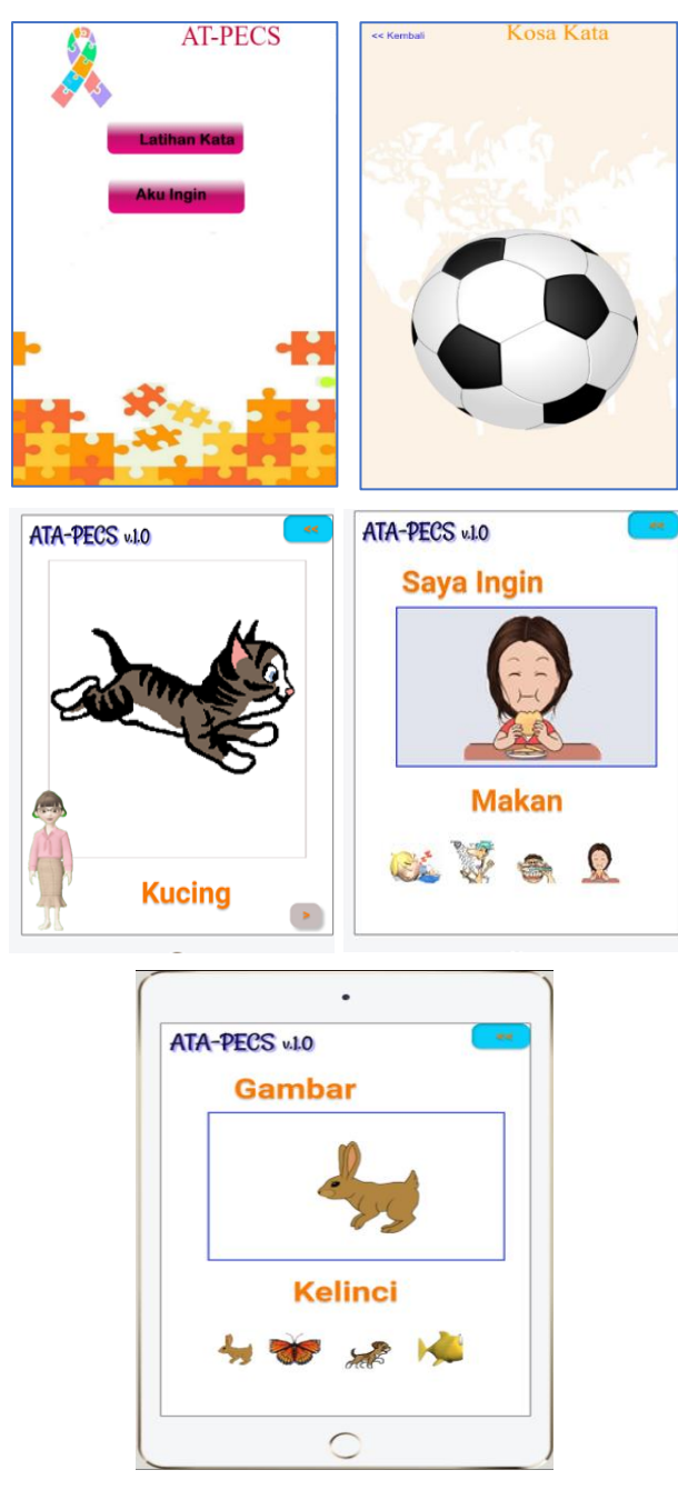
Figure 1 Web-based animated tutor application display.

The curriculum designed so that children go through four stages, namely assessment without feedback, written text intervention, intervention with modified vocabulary, and intervention with modified vocabulary and without text. The child responds verbally during the production intervention and the instructor responds. Children go through three stages of learning until the accuracy is found to reach 100% at the posttest at the final stage of training. Reassessment was conducted after 30 days of the last posttest (Table 1).