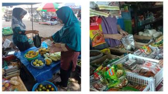
Figure 2 Community Habits Using Plastic Bags When Shopping

Respondents as many as 48 people (87.27%) agreed if there were government policies related to reducing the use of plastic bags and even a ban on their use but, there were 5 people (9.09%) and 2 people (3.64%) whom each expressed less agree and disagree with the policy. According to those who agree, the existence of this policy can help change people's habits so that they can reduce the use of disposable plastic bags in everyday life, especially when shopping is lacking. Those who do not approve of the policy state that the plastic bags provided by traders have become part of their services, meaning that plastic bags have been provided by traders. The habits of the people using plastic bags when shopping are presented in Figure 2. habits of the people using plastic bags when shopping