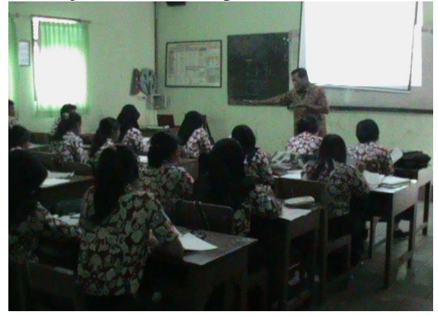
Figure 2. Teaching and learning activities in Citizenship Education, SMA N 1 Purwodadi

Furthermore, the following picture below is one of the learning activities for students in which multicultiral education is delivered in the subject of Citizenship Education.