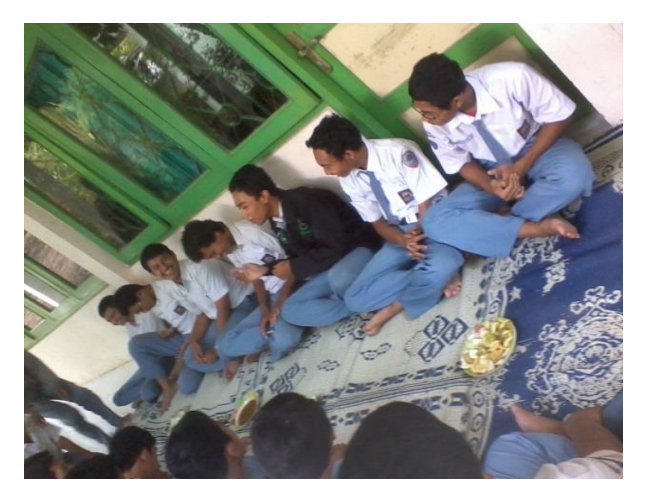
Figure 6. Activities of the express boarding school at SMA N 1 Purwodadi

Based on the statements above, it can be concluded that apart from being inputted in social science subjects, multicultural learning at SMA N 1 Purwodadi through extracurricular activities. Through these extracurricular activities, the spirit of togetherness can be instilled in students from an early age, without discriminating against ethnicity, religion, race or class.