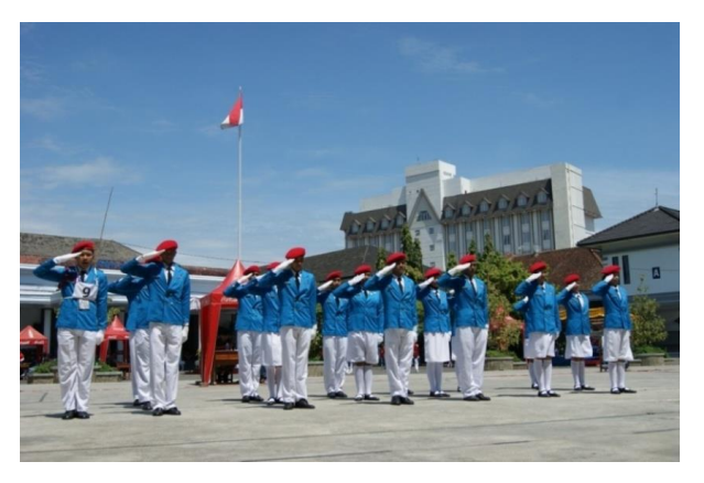
Figure 3. Documentation of the PASKUBARA TEAM (Special Forces for Flag Raising) SMA N 1 Purwodadi

The results of the interview above are strengthened by documentation of the following activities.