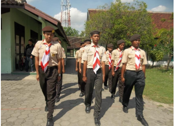
Figure 4. Documentation of Scouting Activities at SMA N 1 Purwodadi

Similar to Paskubara's activities, the recruitment of Scout members also does not differentiate between the race and religion of students. Extra Pramuka activities at SMA N 1 Purwodadi are held once a week on Friday. For all class X students, this activity is mandatory to follow. Pramuka SMA N 1 Purwodadi has participated in various events, including the scout competition for enforcers at Unnes, Bima II at SMA N 1 Purwodadi and the inauguration of the troop council.