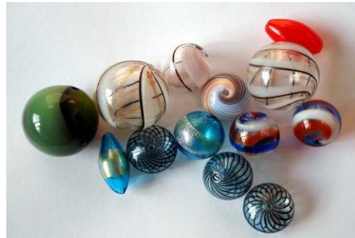
Fig. 1. Point-shaped glass decorations.

different environment will make a sense of being small and exquisite, as shown in the "Fig. 1":