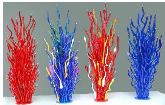
Fig. 4. Multi-color glass decorations.

When designing colorful glass decorations, people can add various required colors during the production for decoration. If people want to design a comprehensive colorful glass decoration such as red, blue, yellow, white, etc., it is necessary to add red, blue, yellow, and white when melting glass materials at a certain high temperature, and then make the production according to the effect picture of the decoration. After cooling, the required red, blue, yellow, white and other comprehensive colorful glass decorations are made. A variety of red, blue, yellow, white and other colorful glass decorations are particularly beautiful in a certain decorative environment, as shown in the following figure: ("Fig. 4")