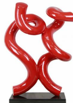
Fig. 2. Linear glass decorations.

Linear glass material has the sense of speed, lightness and fineness. After applying this material in decoration, it has different decoration effects in different environments. How are linear glass decorations designed and made? Now let's take a look at the specific design and manufacturing operation. According to the needs of decoration in different environments, it is required to design the modeling of the decoration, draw the effect picture of the decoration, and melt the glass material at a certain high temperature. According to the designed effect picture of the decoration, it is better to make the linear glass decoration step by step along the effect picture. This kind of linear glass decoration is different from that of other materials. The linear glass decoration has the sense of being thin, transparent and speed. It gives people a relaxed, fine and pleasant feeling when it is placed in different environments. And it will give out dazzling light when it is placed in strong light. Linear decorations of other materials are thick and strong, having no sense of transparency. Under strong light, they will not give out beautiful light. The linear glass decorations are as follows: ("Fig. 2")