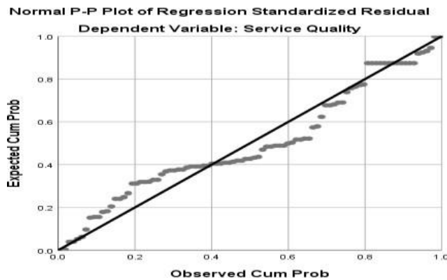
Figure 1. Normality Test Results

The results of the normality test of this study can be seen in the figure below: