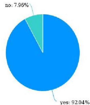
Figure 3. The rate of agreement to know more about Young-Duck Group.

Meanwhile, the project has analyzed the differences in the degree of influence varies between different people. First, the project has divided the respondents into male and female. On the one hand, the percentage of male respondents who support Haier very well has increased from 66.31% to 77.27%, and the difference is 10.86%. On the other hand, the percentage of female respondents who support Haier very well has increased from 67.8% to 89.51%, and the difference is 21.71%. Moreover, the percentage of male respondents that agree to know more about the Young-Duck Group is 89.3%, and the percentage of female respondents is 95.88%.