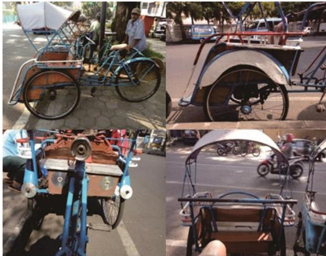
Fig. 2. Cycle Rickshaw Condition in Klojen Sub-district.

In general, the condition of rickshaws in Klojen Sub-district, which are currently operating generally have not changed their appearance from the beginning until now. Fig. 2 shows the current condition of cycle rickshaw transport in Klojen Sub-district, Malang City.