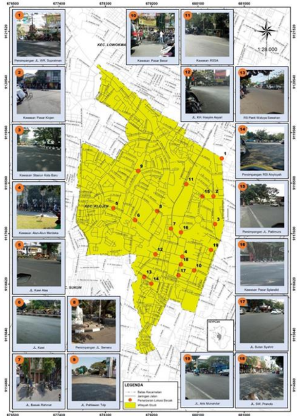
Fig. 1. Study Area Location.

The results of calculating the driver, passenger and cycle rickshaw samples are then proportioned to each base.