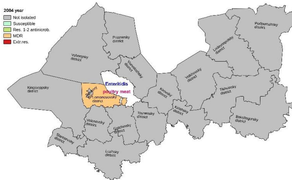
Fig. 1. Isolation of Salmonella strains in the Leningrad region in 2004 and their susceptibility to antimicrobials

Figures 1 - 3 illustrate how the isolation geography of antimicrobial resistant strains spread has changed.