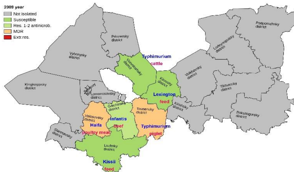
Fig. 2. Isolation of Salmonella strains in the Leningrad region in 2009 and their susceptibility to antimicrobials