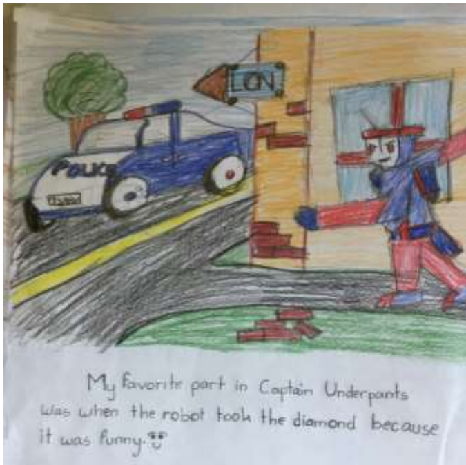
Fig. 2. Another example of a student's writing

Despite the grammar mistakes the student made, it is very obvious that the student was able to self-direct himself on what to draw and what to write.