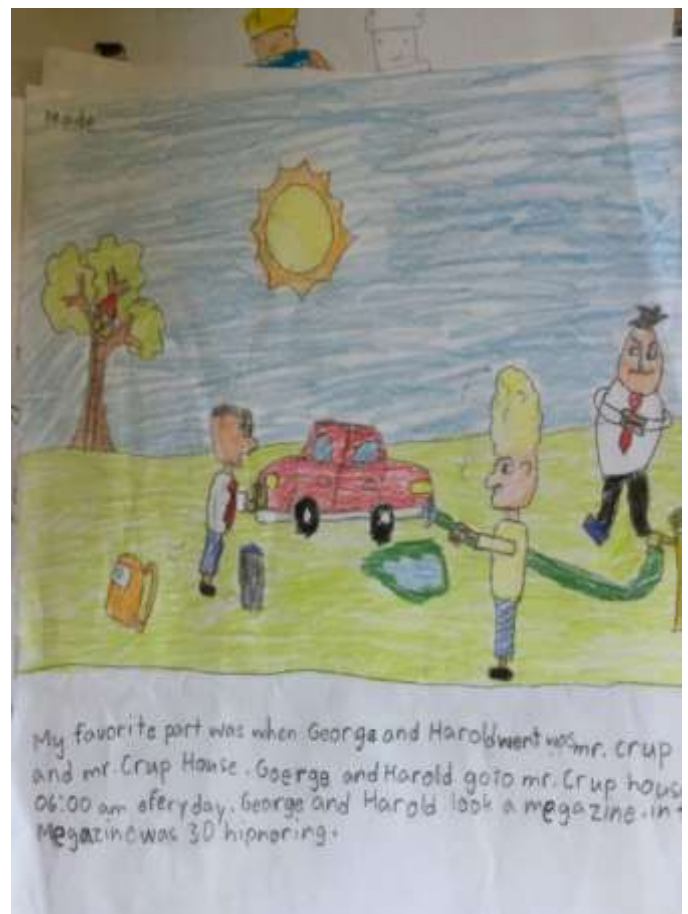
Fig. 1. An example of student's writing

The implementation of the teaching and learning process using primary literacy guidelines was conducted in eight meetings. Each meeting consisted of three stages with some learning activities. Those three stages were the introduction stage (pre-activity), implementation stage (whilst activity), and establishment stage (post-activity). The teacher also used the Lesson Plan or teaching scenario for the implementation of Primary English literacy guidelines. The lesson plan consisted of the topic of learning, allocation of the time, teacher's activities, students' activities, the visual aid used in the learning process, and the task for the students. Those lesson plans were arranged based on the Primary English Literacy Guideline book and prepared for eight meetings [12]. In the introduction stage, the teacher checked the students' logbook and implemented interactive storytelling activity or read the story to the students. During the interactive storytelling, the teacher told a story by reading the storybook for the students in front of the class. After telling the story, the teacher asked the students to answer several questions related to the story. Then, the teacher gave a chance for students to read aloud the same story in front of the class. The followings are the examples of the writings made by the students.