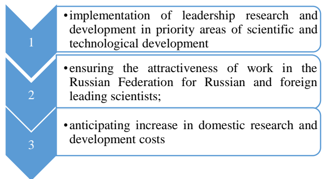
Fig. 1. Key objectives of the national project “Science”

Key objectives of the national project “Science” are presented in Figure 1.