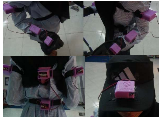
Fig.1 esMOCA Instrument

This research is attempt to test the usability of esMOCA instrument by comparing the biomechanics analysis using esMOCA and photographic method using performance measurement method The preparation of instrumen starts from preparing the sensor, applying the sensor to the upper limbs, and opening the simulink program to execute operator body movements.