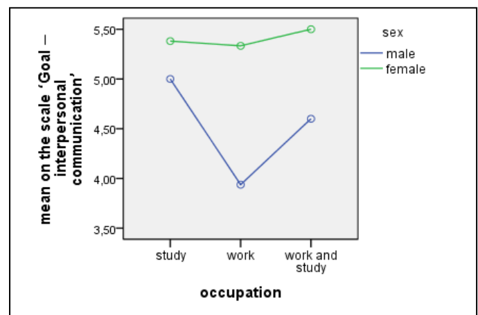
Fig. 1. The extent of average amounts of Internet-consumption for the purpose of communication among male and female groups of users with different types of occupation

Among male consumers, surfing the Internet with the purpose of communication is characteristic for the group of the sample who currently study at higher educational institutions (average amount is 5.000). Employment reduces interest in consuming Internet-resources in order to communicate. Differences among consumers are illustrated with the following graph. (Fig.1).