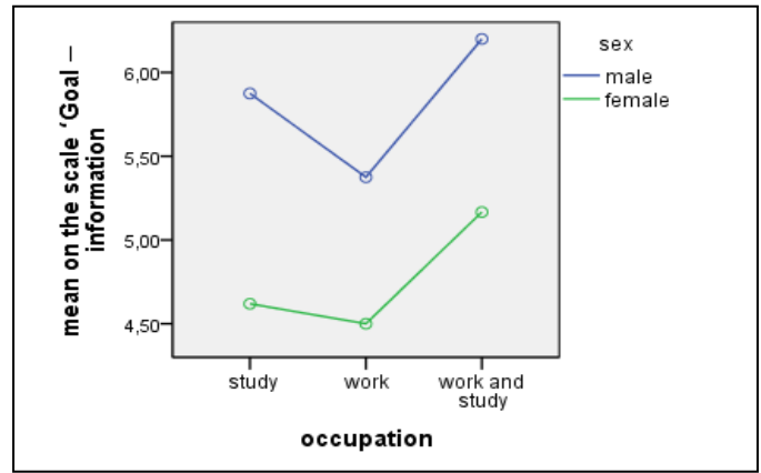
Fig. 3. The extent of average amounts of Internet-consumption aimed at obtaining information among male and female users with different types of occupation.

Drawing upon the data of Fig. 3. we can claim that using Internet resources for the purpose of obtaining information is more typical for the male sample (average values range from 5.400 to 6.340). However, when compared in the type of occupations, consumers combining learning and work are more likely to use the Internet for the sake of obtaining information (it is true either for male or female sample). Probably, it is the necessity of carrying out various tasks that increases the users' need for information.