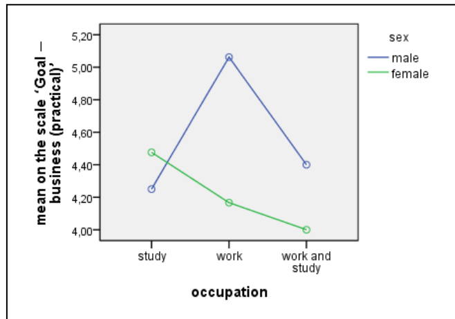
Fig. 5. The extent of average amounts of using the Internet for business (practical) purposes among male and female users with different types of occupation.

From the graph (Fig. 5) it is gathered that it is men, especially those classified as working youth (average value is 5.224), focus on using Internet-resources for business (practical) purposes (work/study/doing business). Girls undergoing training also admit using the Internet for practical reasons, but average amounts on the sample do not exceed 4.500.