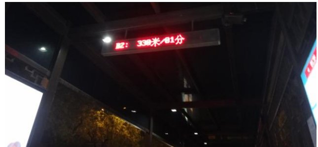
Fig. 1. Instant message screen at BRT bus station in Hangzhou

and dispatching center, and dynamic bus information display on the electronic bus-stop board. Fig. 1 shows the instant message screen at BRT bus station in Hangzhou, which displays B2 is 330 meters away from the station and will arrive in about 1minute.