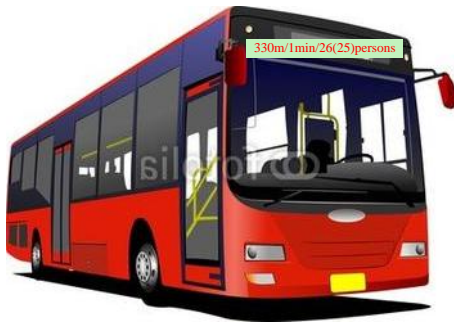
Fig. 3. Case of bus information display

The electronic card system in buses can count passengers. However, some buses have no electronic swiping-card terminals. To monitor and count passengers correctly, we set a video controller with central processing unit above the bus lane for collecting number of passengers. The image collector of video controller can collect video images which will be sent to the video passengers counting module in the central processing unit after A/D conversion for real-time operation. The operation results will be stored in the RAM and finally sent to terminals of bus control center by the video controller through the network interface and supporting communication protocols. The vehicle-mounted mobile screen is keeping in real-time synchronization with the server at bus control center. Dynamic bus information is updated continuously and displayed on the vehicle-mounted mobile screen simultaneously. Therefore, passengers waiting at the bus stations are informed conditions of this bus and the following one (interval time and carrying passengers), thus enabling them to decide whether take this bus or wait for the next one. Server at bus control center calculates and estimates interval between two buses according to returned bus information and display it on the electronic bus-stop board and vehicle-mounted screen.